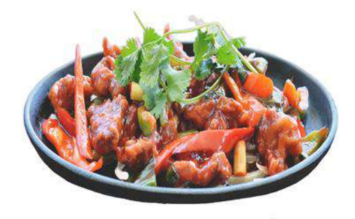
M22. Sizzling Pork Plumbsauce26.50