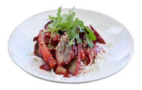
M2.Honey BBQ MarinatedPork26.00