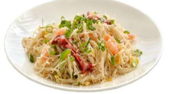
S9. Hokkien noodle