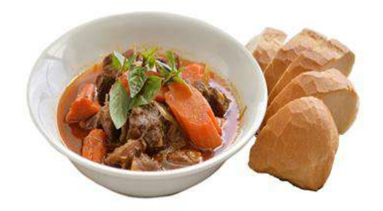
M20. Braised Beef with Vietnamese Roll 26.00