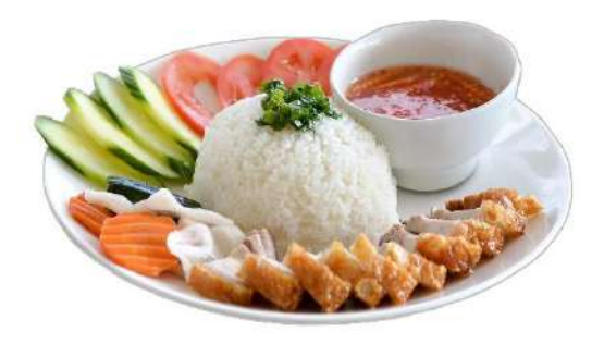
L8. Crispy skin roasted pork rice