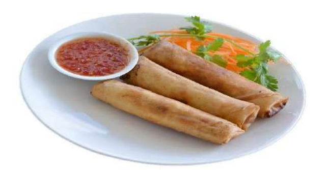
E1. Vietnamese chicken spring rolls (3) 9.00