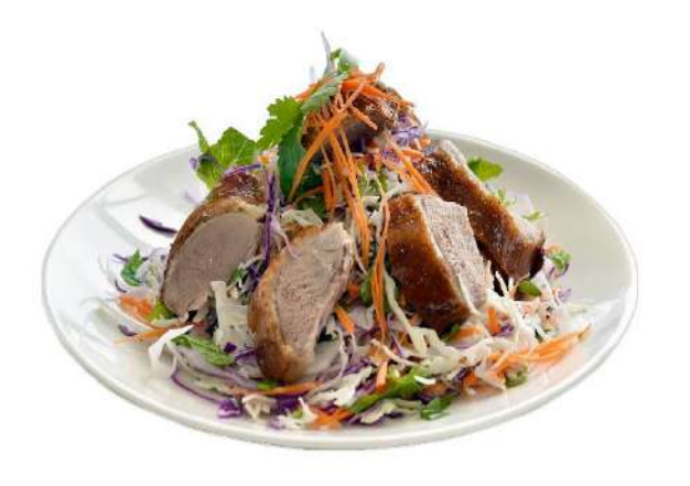
S14. Steamed Chicken Salad 23.00