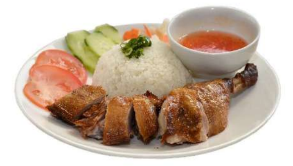
L14. Roasted duck with steamed rice