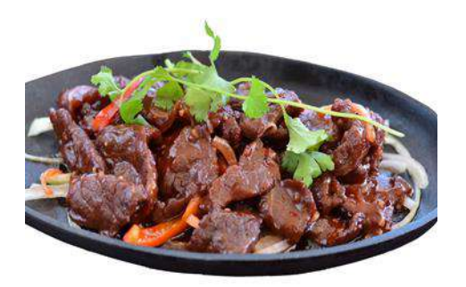
M3. Sizzling Steak BBQ Plumb sauce 27.00