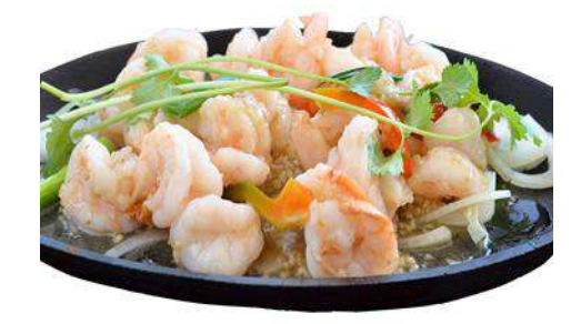
M10. Sizzling Garlic KingPrawns27.00