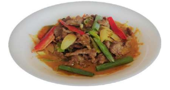
M48. Vietnamese Beef curry 25.00