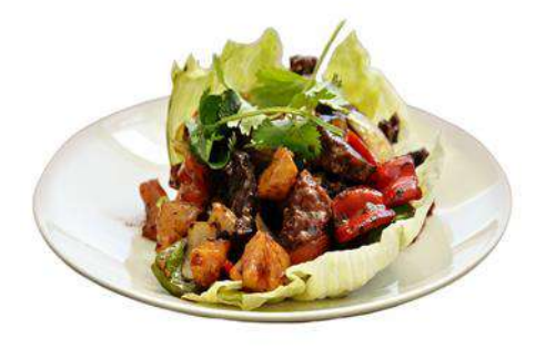
M23. Stir-Fry Vietnam Style Beef 27.00