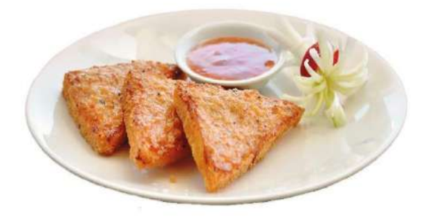
E10. Chicken & prawn on toast (3) 9.00