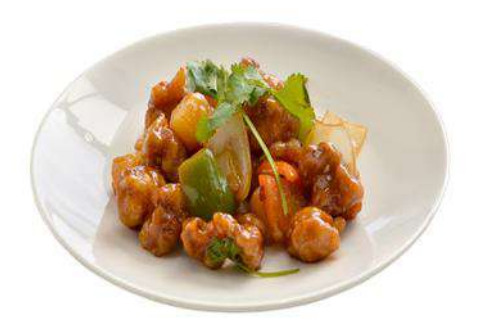
M14. Sweet & SourBattered Pork24.50