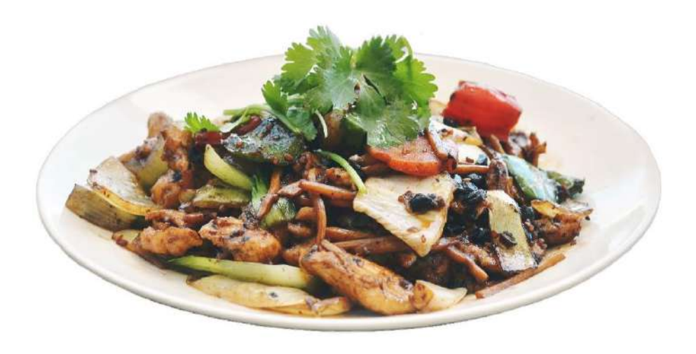
M42. Stir fry BBQ pork black bean - with ginger, seasonal vegetable