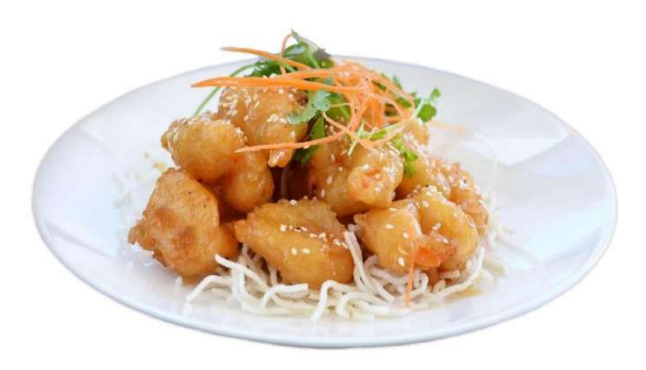
M9. Honey King Prawn – deep-fried lightly battered prawn then sautéed with homemade honey sauce.