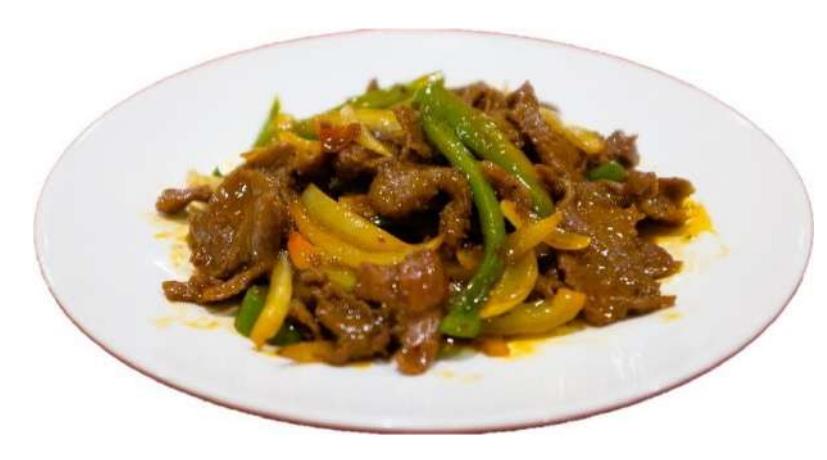
M54.Szechuen Lamb stir-fry - with Szechuan chili sauce green onion, onion & capsicums