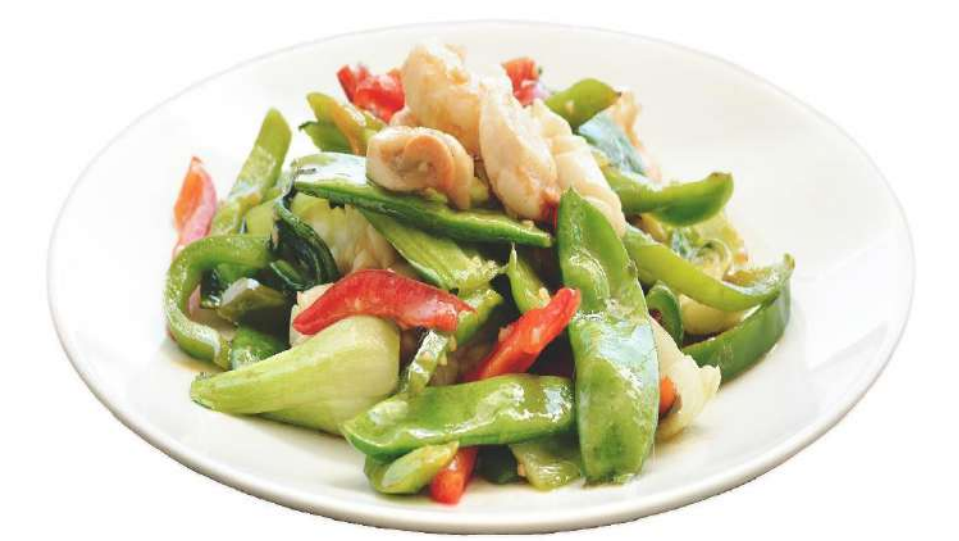
M30. Stir-fried Scallops— with snow pea & seasonalvegetable25.00