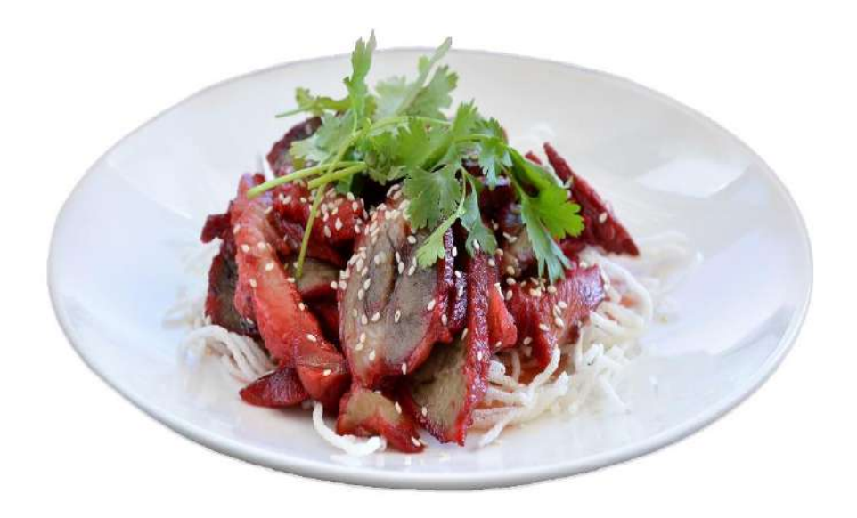
M2. Honey BBQ Pork – grilled homemade marinated pork then sautéed with honey sauce.