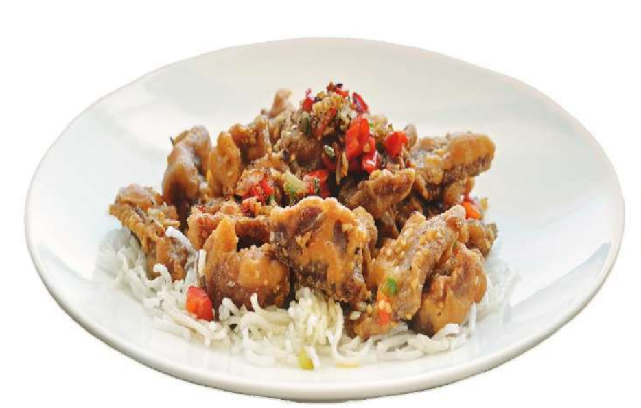
M21. Salt & Pepper Pork – lightly battered pork loin with salt & pepper seasoning