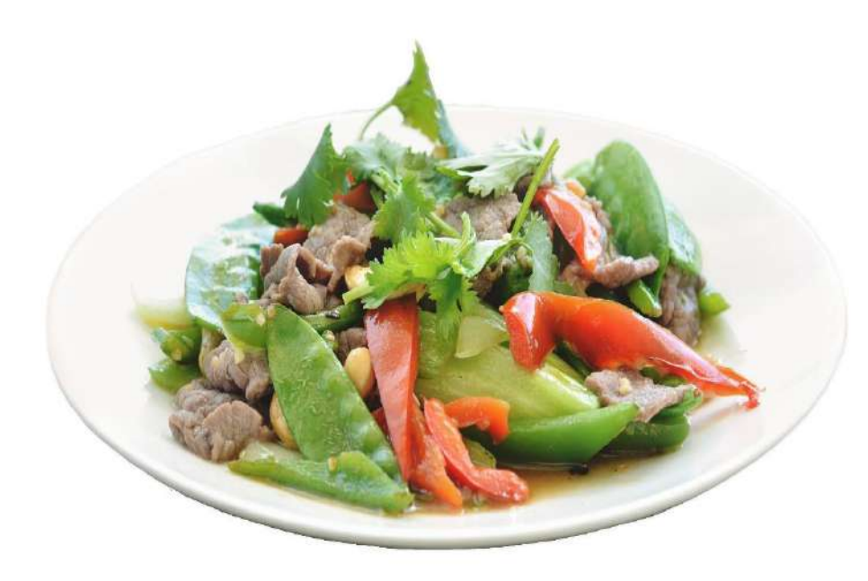
M28. Stir-fry Beef & Vegies – with cashew nut, capsicum, bokchoy & snow pea