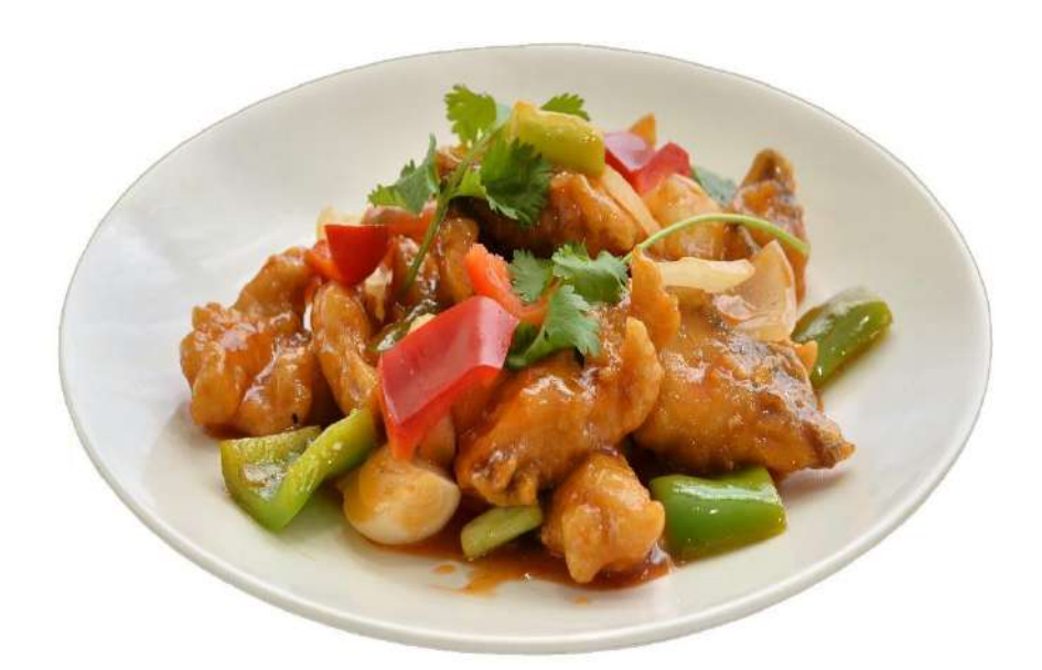
M18. Sweet & Sour Fish – deep-fried lightly battered fish with sweet & sour sauce