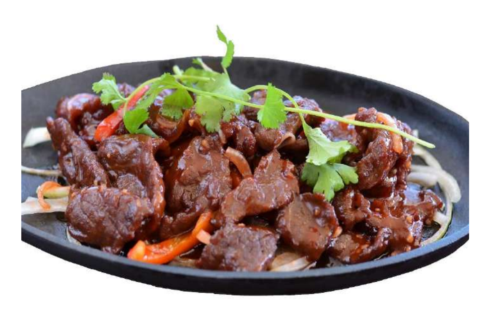
M3. Sizzling Steak – with BBQ plum sauce marinated on hot-plate, onion & capsicums.