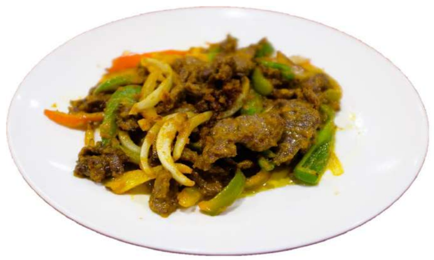
M46. Flaming Beef Satay – with sate sauce green onion, onion & capsicums