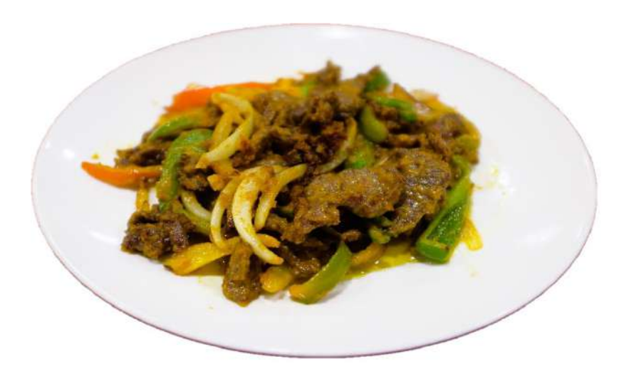
M53. Flaming Lamb Satay – with sate sauce green onion, onion & capsicums

M43. Stir fry BBQ Pork & Vegies - with ginger, cashew, seasonal vegetable 26.00