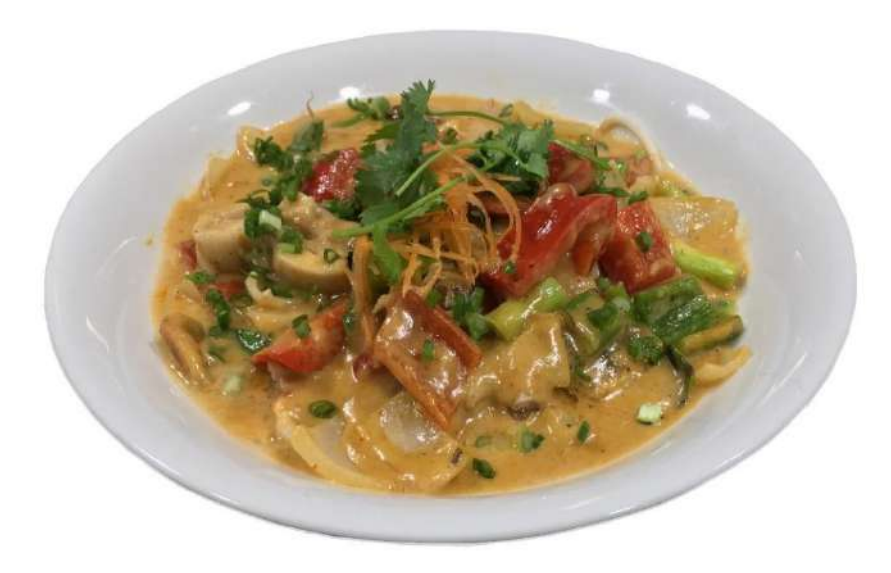
M31. Asian Chicken Red Curry – deboned marinated chicken, bean sprout, capsicum curry