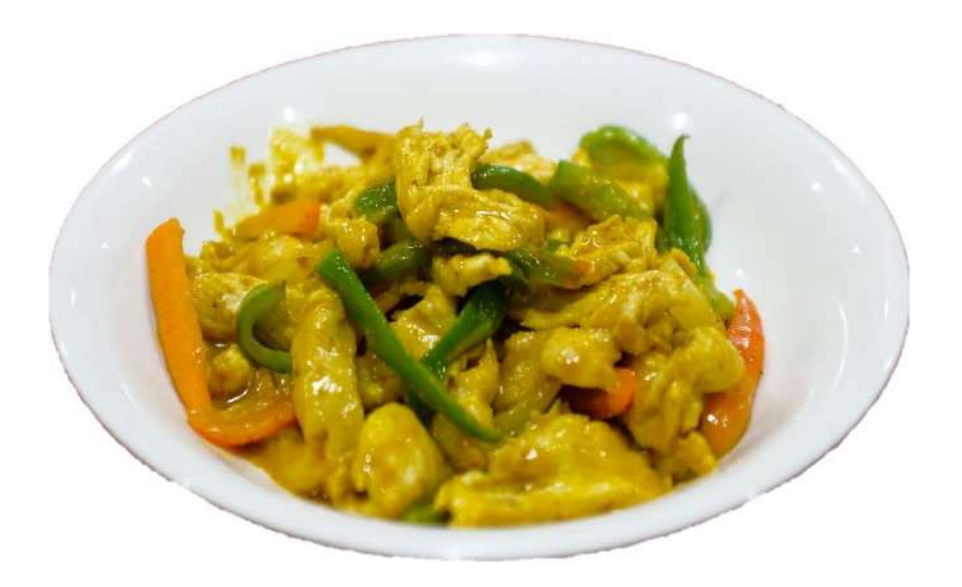
M50. Vietnamese Chicken Curry – deboned marinated chicken, capsicum, carrot, curry sauce