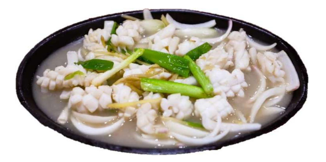
M1. Sizzling Squids – Stir-fry marinated squids in ginger & shallot sauce, serve on hot-plate