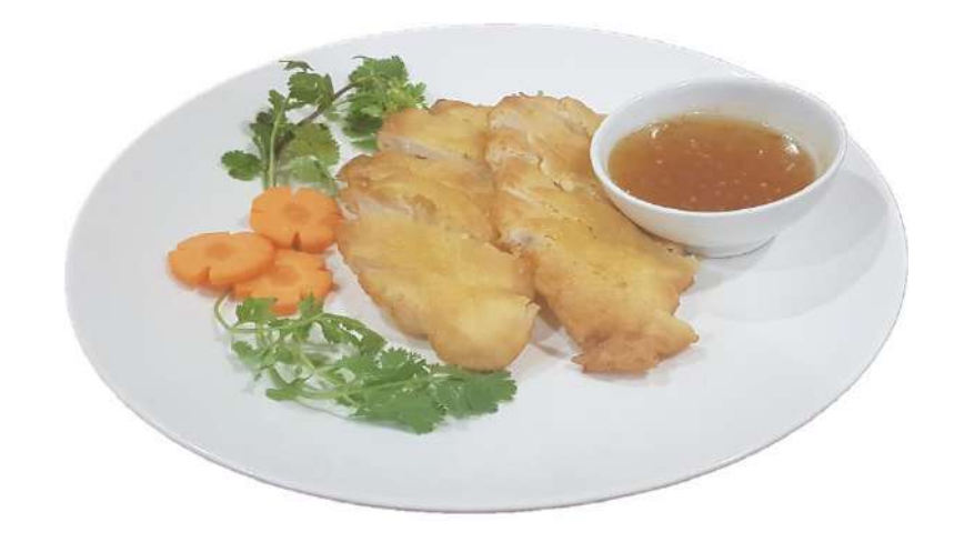
M4. Crispy Lemon Chicken— deep-fried lightly battered chicken with homemade sauce.

M52.Szechuen Chicken stir-fry -with Szechuan chili sauce green onion, onion & capsicums 25.00