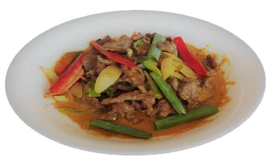
M48. Vietnamese Beef curry – With carrot, onion, capsicum, curry sauce