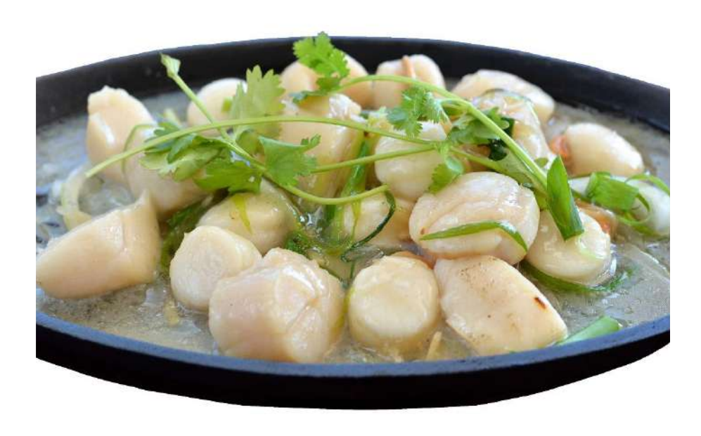
M12. Sizzling Scallops – Stir-fry marinated scallops in ginger & shallot sauce, serve on hot-plate