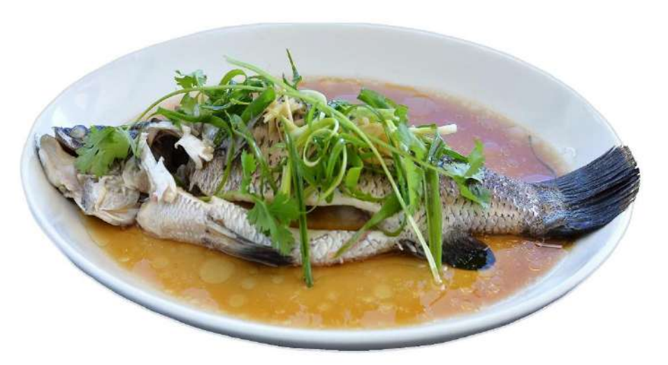
M8. Ginger Shallot Barramundi – Steamed with julienne ginger & soy sauce