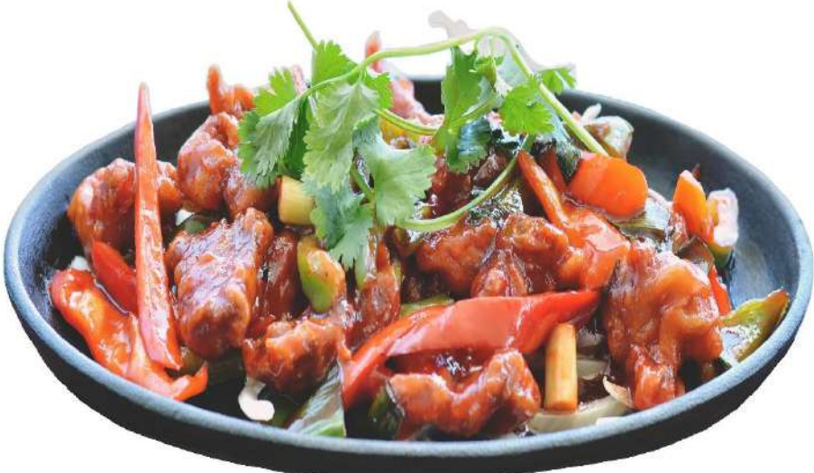
M22. Sizzling Pork – lightly battered pork loin sautéed with plum sauce