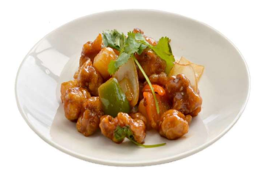
M14. Sweet & Sour Pork – deep-fried lightly battered pork then sautéed with sweet & sour sauce