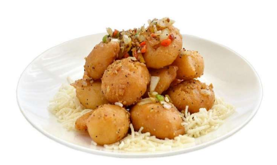
M16. Salt & Pepper Prawn – deep-fried lightly battered king prawn salt & pepper seasoning