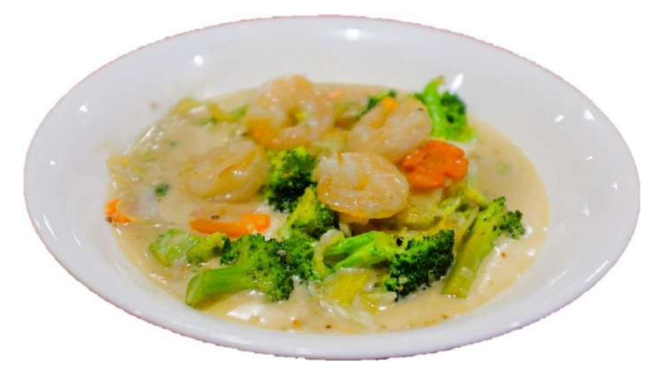
M45. Vietnamese Prawns curry—marinated prawn with