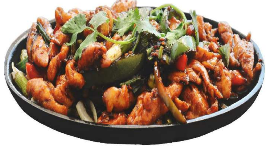
M29. Sizzling Chicken – with hoisin sauce marinated on hot-plate, onion & capsicums.

M59. Sweet & Sour chicken – deep-fried lightly battered chicken with sweet & sour sauce 26.00