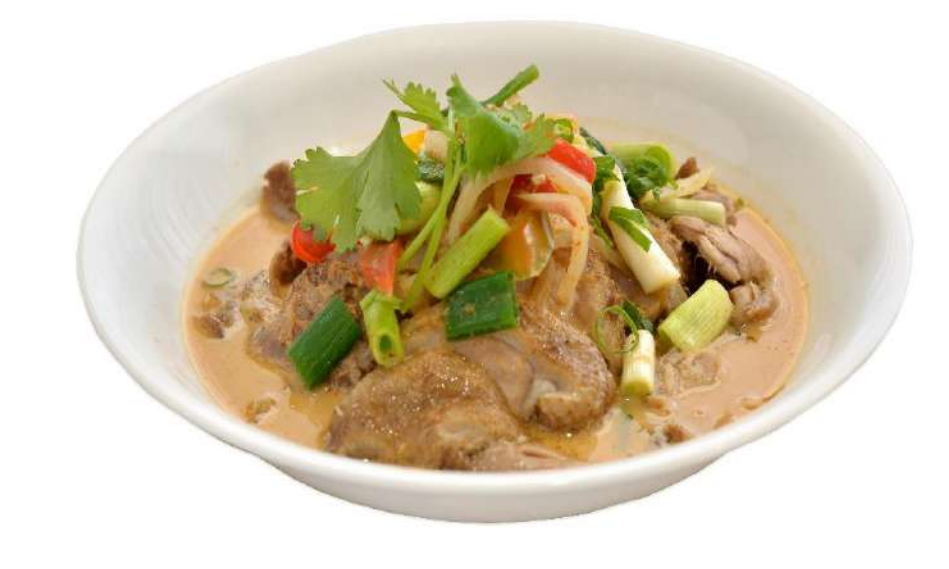
M13. Asian Duck Red Curry – slow cook de-bone duck on bed of bean spout & capsicum