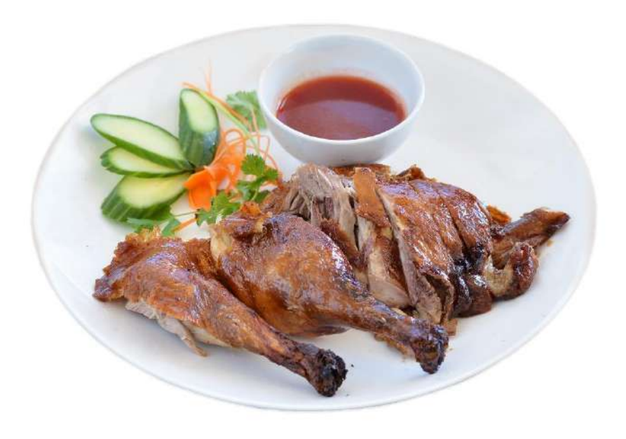
M5. Crispy Skin Roasted Duck – serve with soy sauce