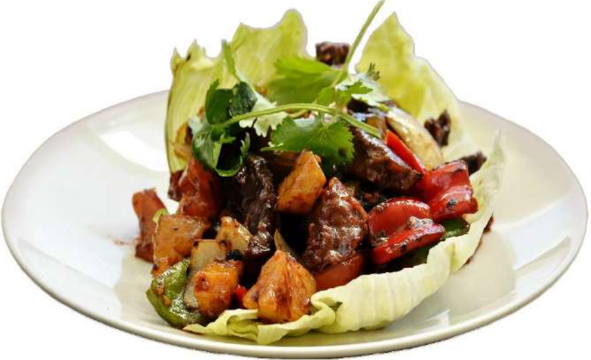
M25. Stir-fry Beef & Black Bean – with seasonal vegetable