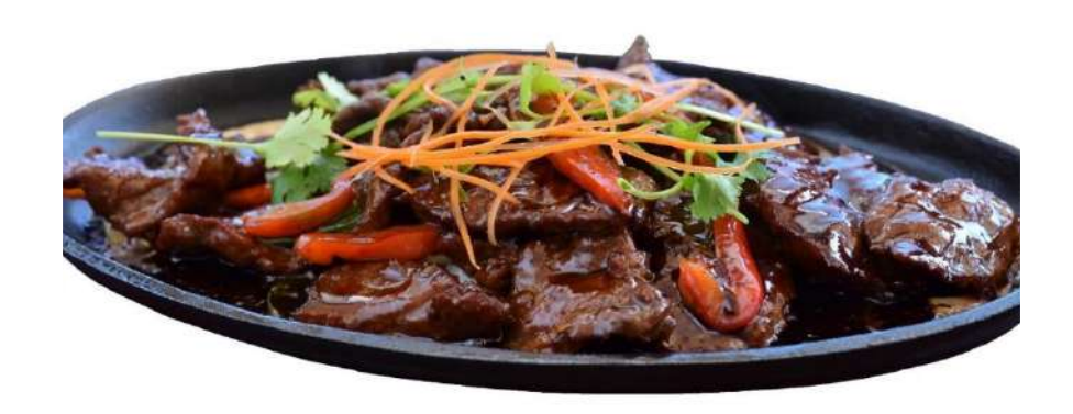
M7. Sizzling Lamb – with marinated BBQ sauce serve on hot-plate, onion & capsicums.