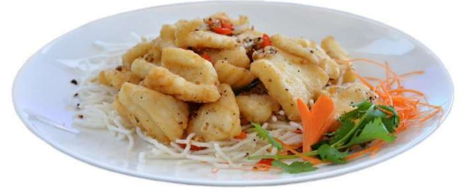
M11. Salt & Pepper Squids – crispy deep-fried lightly battered squids with salt & pepper seasoning