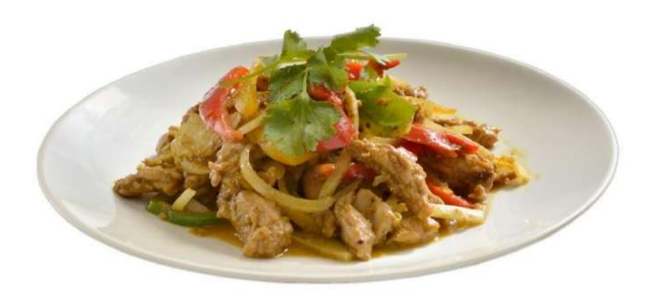
M19. Stir-fry Chicken – Lemongrass marinated chicken with onion & capsicums