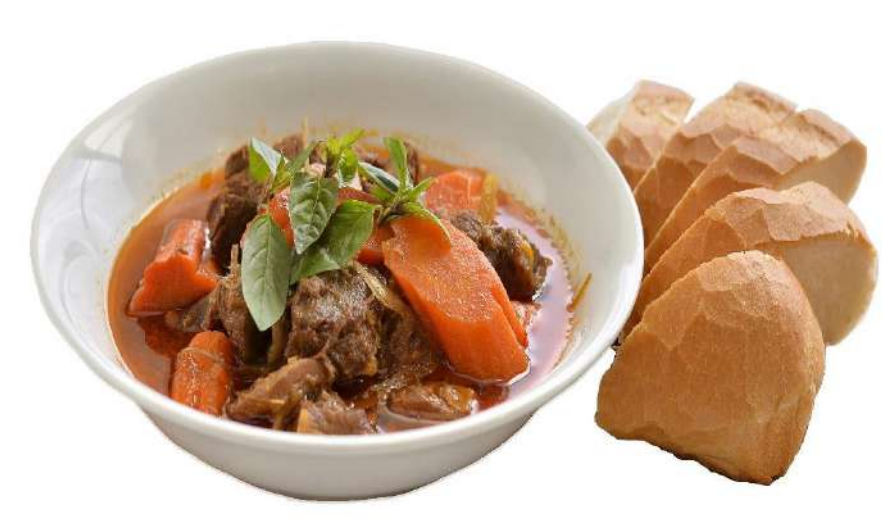
M20. Braised Beef – slow braised beef and carrot service Vietnamese roll.