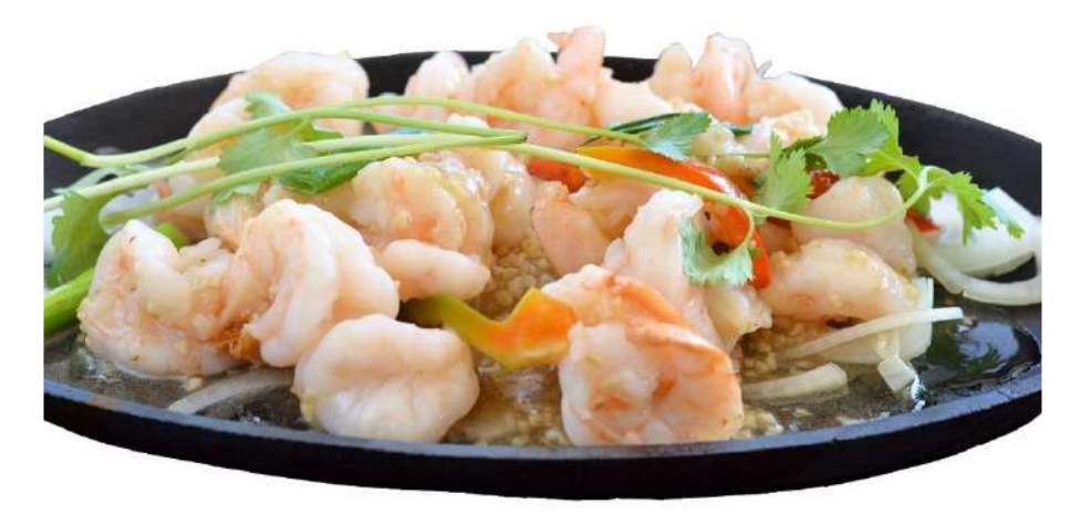
M10. Sizzling Garlic Prawns – stir-fried marinated prawn with garlic sauce, serve on hot-plate