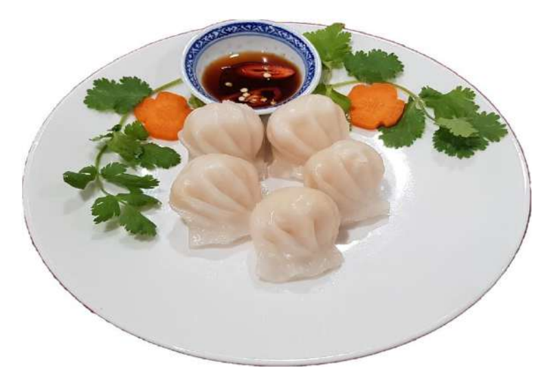
E20. Prawn Dumpling (5) with soy sauce