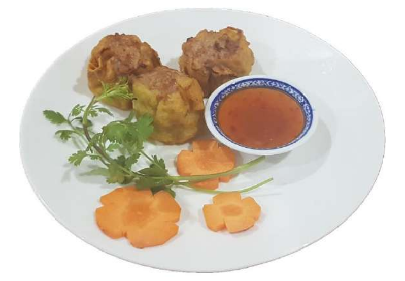
E15. Steam Dim Sim (3) with sweet chilli sauce 7.00